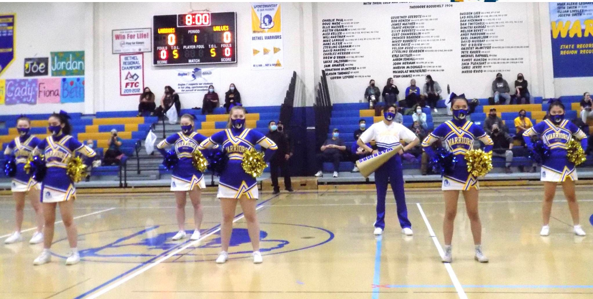
The Warriors perform a center court cheer at the start of a basketball game two weeks ago.