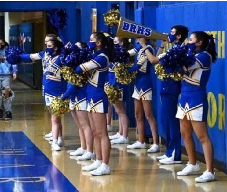
The BRHS cheer team fires up the basketball team with their enthusiasm last weekend.

The BRHS cheerleaders have been cheering for the varsity the past couple of weeks. They have been making good progress and doing an amazing job performing for our basketball teams.